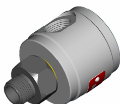
GSN, GH Series / GSN, GH 系列

Rotating joints for air and hydraulic oil at high pressure, the rotor is made of hardened carbon steel and lapped for reducing friction torque. The external body is machined from aluminum bar to avoid any porosity.